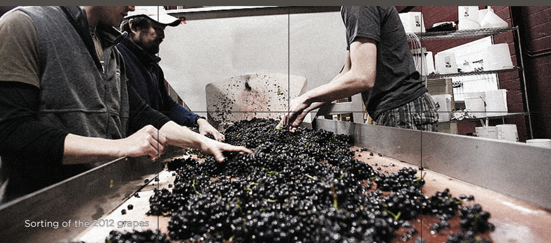
Sorting of the 2012 grapes