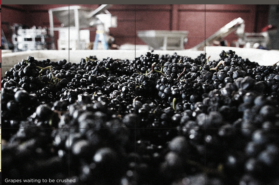
Grapes waiting to be crushed