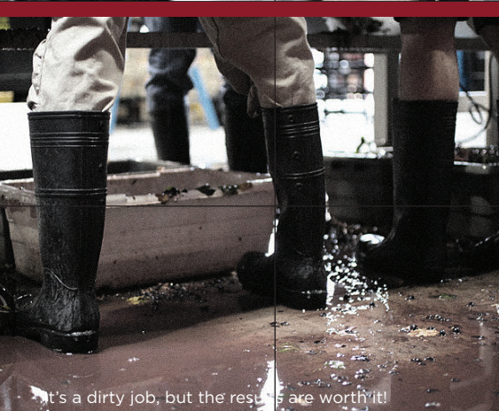
It's a dirty job, but the results are worth it!