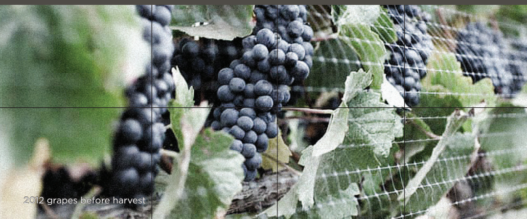
2012 grapes before harvest

November 8-9, 2013 Big Sur Food & Wine Festival