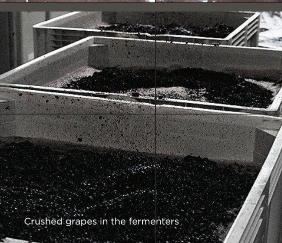
Crushed grapes in the fermenters