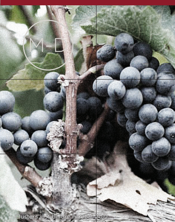
Clusters just before harvest 2012