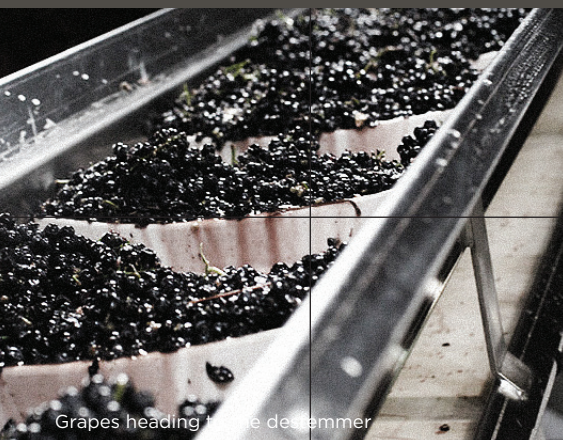
Grapes heading to the de-stemmer