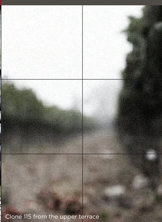
Clone 115 from the upper terrace