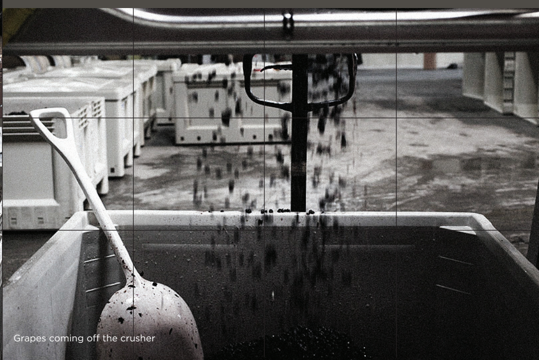
Grapes coming off the crusher

We are happy to report that 2012 was an excellent year in the vineyard for the Peterson Vineyard, as well as the other vineyards in the Santa Lucia Highlands appellation, with nearly perfect growing conditions. There were no late frosts or storms to upset the flowering or bud break. The Spring and Summer brought consistent temperatures in the 70's to the Santa Lucia Highlands with no significant heat spikes. And the Fall rains were kind enough to hold off until after harvest. These ideal conditions produced well formed clusters and even sized berries. The good balance between canopy and clusters produced a rare combination of strong yields and high fruit quality. Winemaker Ed Kurtzman believes the last time he saw a comparable vintage to 2012 was 1997, when there was a large crop of very healthy and high quality Pinot Noir. He believes 2012 has the advantage over 1997, however, because of the additional ripening time with the moderate late summer and early fall temperatures of 2012 as opposed to the heat spikes of 1997.